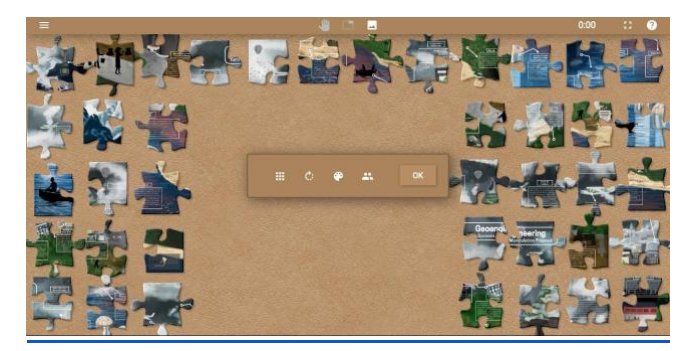
2 Asia-Pacific: Volcanic Disruption (Artist: Catherine Dizon)