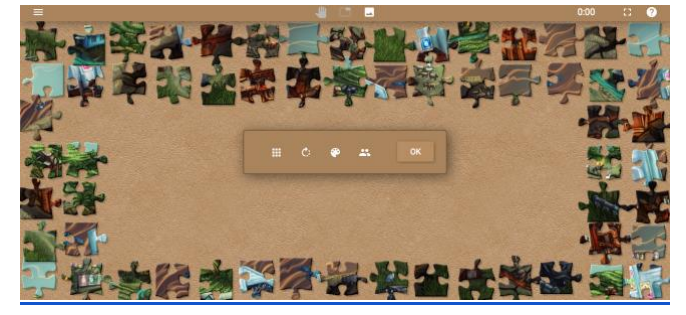
1 Asia-Pacific: Nightmare or Nirvana? (Artist: Charley Hall)