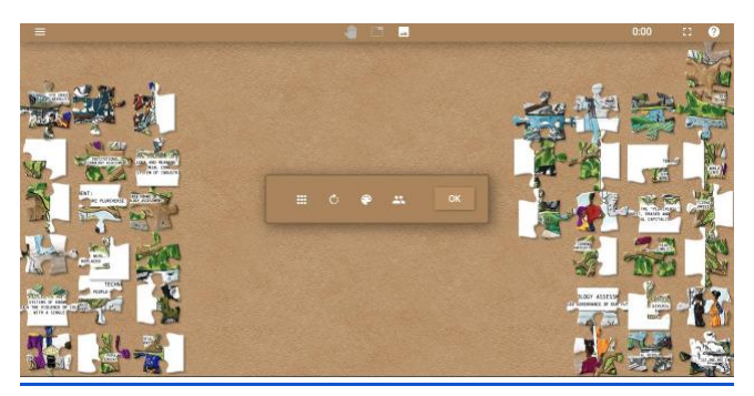
4 Asia-Pacific: Towards people-led governance! (Artist: Camille Etchart)