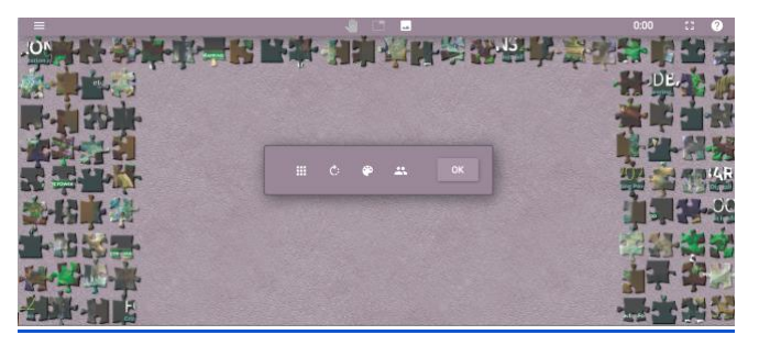
5 Food Barons: cover art (Artist: Garth Laidlaw)