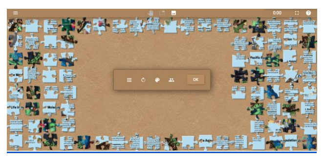
3 Asia-Pacific: Molecular manipulation (Artist: Catherine Dizon)