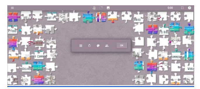
7 Food Barons: Food delivery sector (Artist: Andre M Medina)